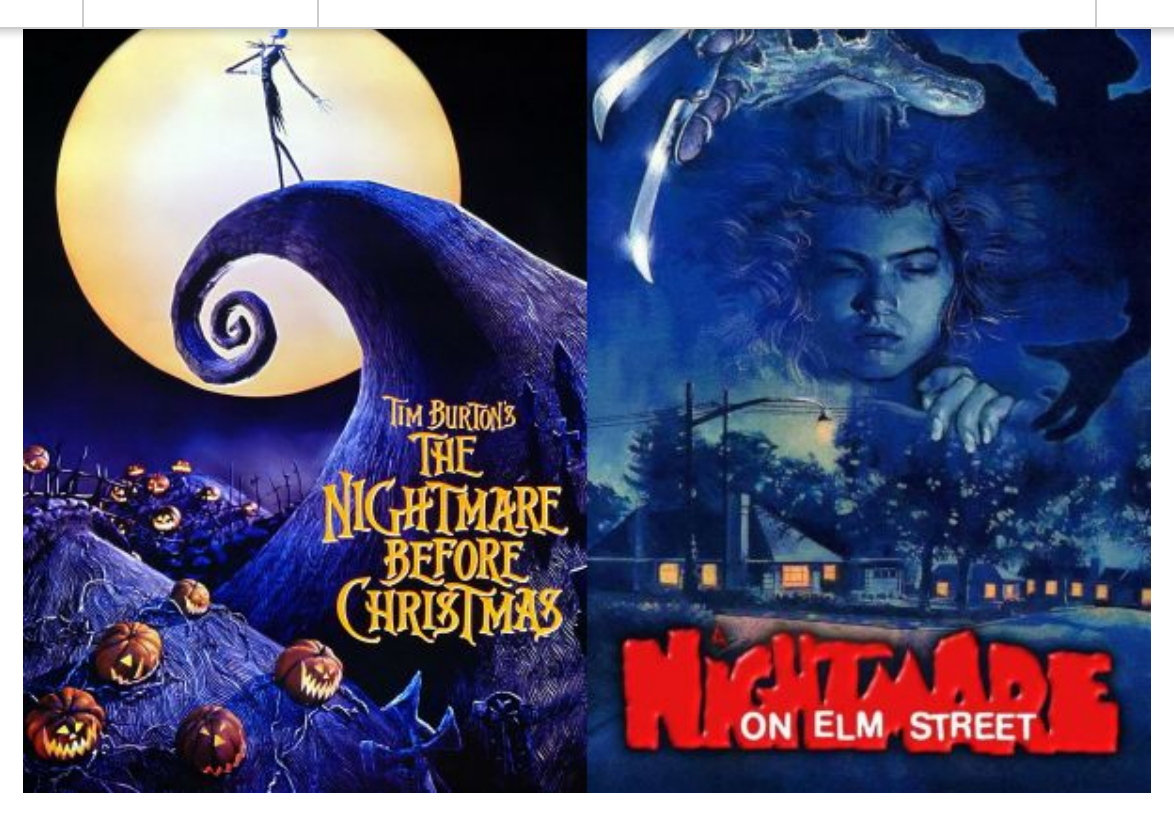
Saturday, October 5th - Nightmare at The Senate double feature Tim Burton's The Nightmare Before Christmas @ 4:00 PM A Nightmare on Elm Street @ 8:00 PM