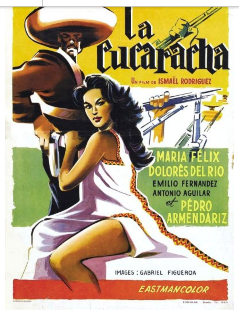
Saturday, September 28th @ 8:00 PM - La Cucaracha ( The Soldiers of Pancho Villa , 1959)