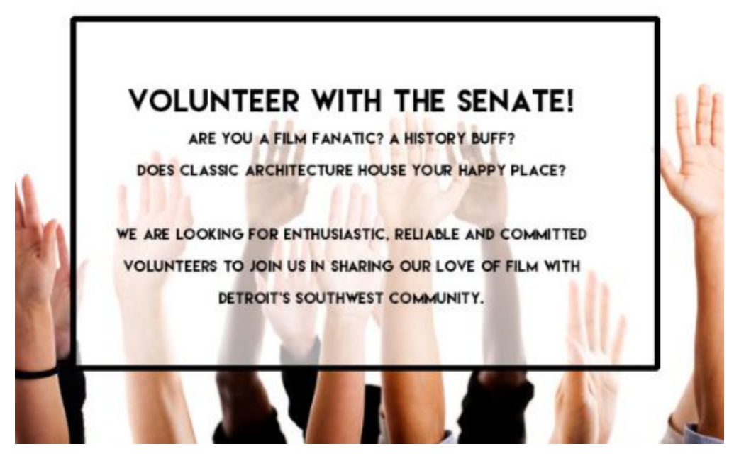
<u>Click here</u> to get more info on volunteering regularly, and joining our non-profit community theater!