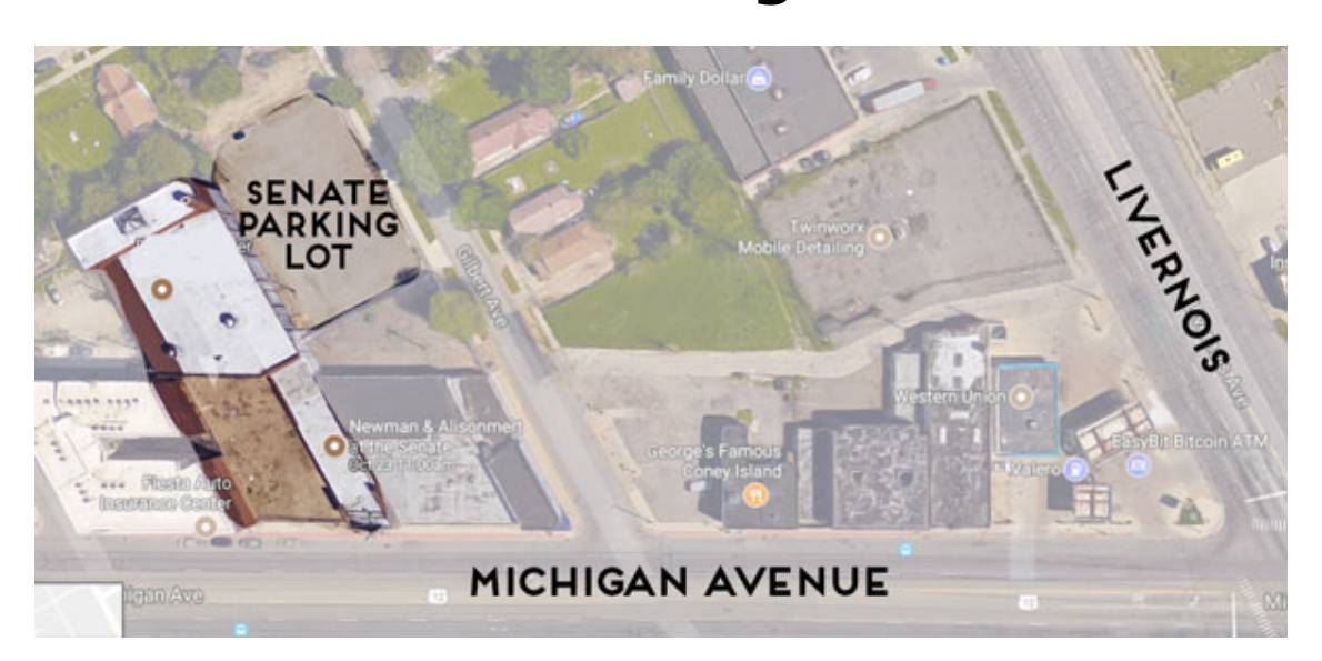
Parking is available in our gated lot, on Gilbert, and Michigan Avenue.