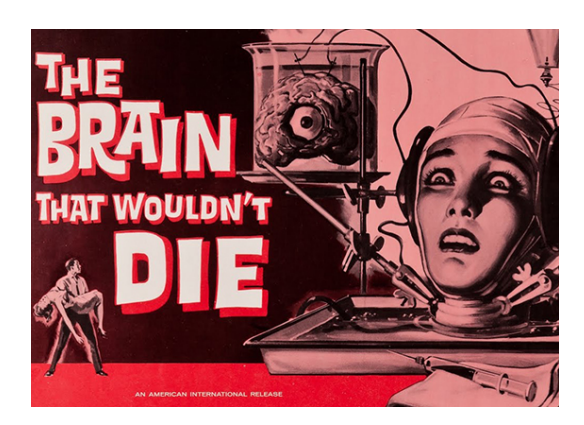
Friday, July 26th @ 10:00 PM -The Brain That Wouldn't Die (1962)