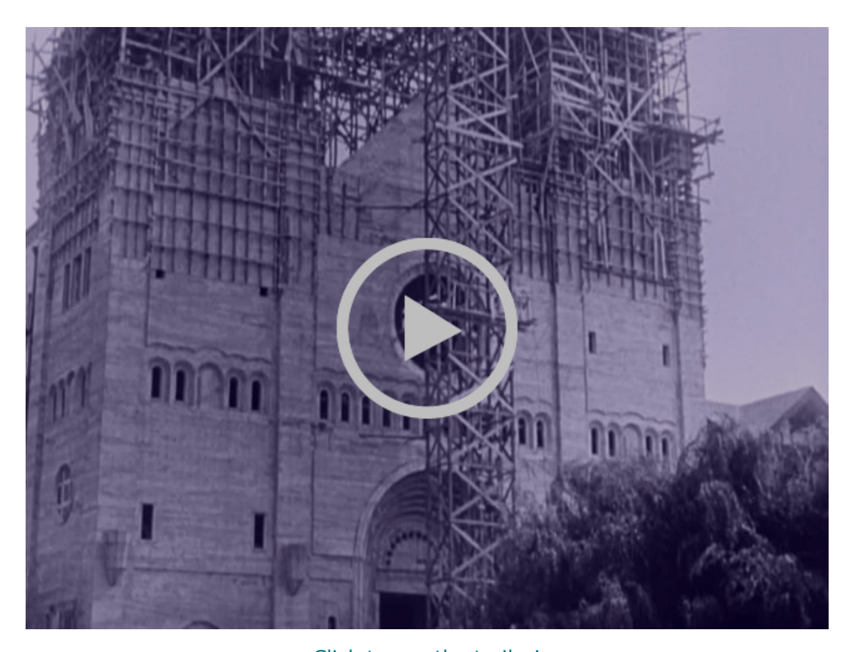
Click to see the trailer!

Doors: 7:00 pm Showtime: 8:00 pm Tickets: $10.00