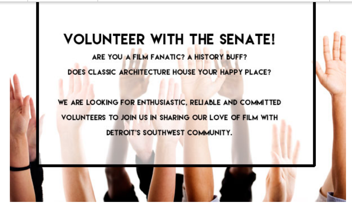
Click here to get more info on volunteering regularly, and joining our non-profit community theater!