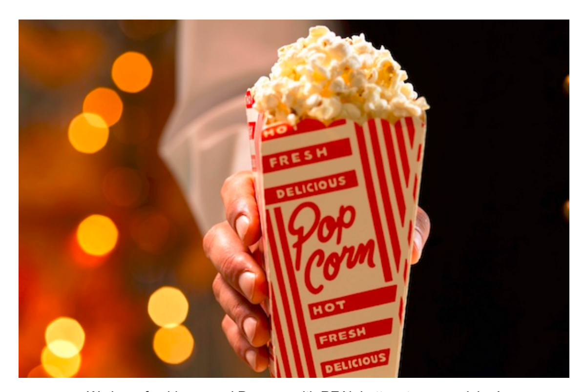
We have freshly popped Popcorn with REAL butter at our snack bar!