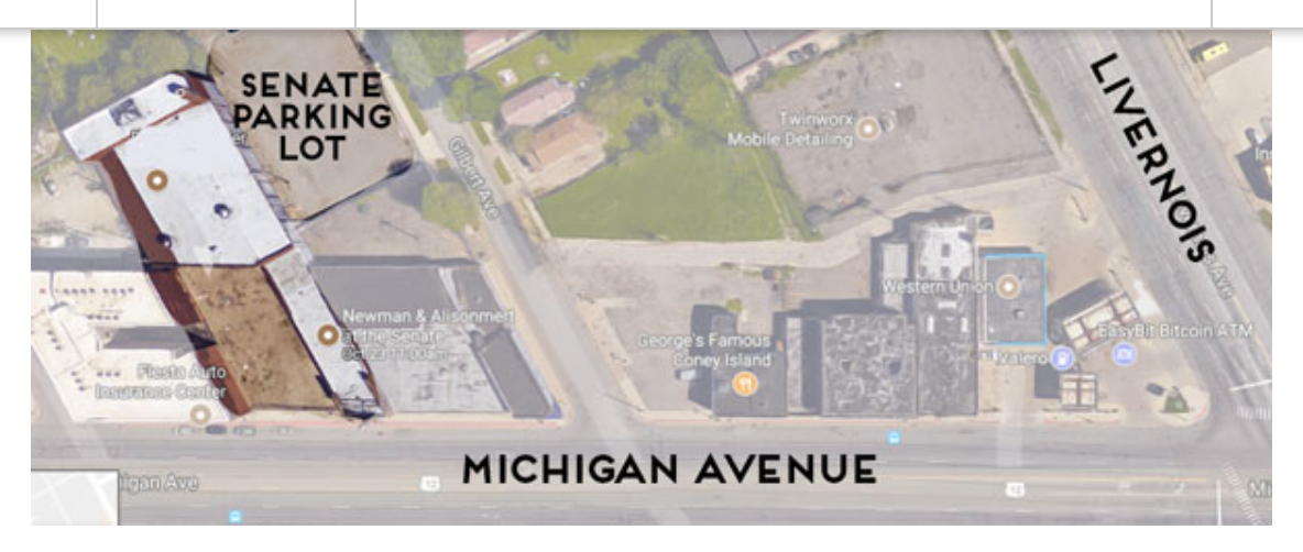
Parking is available in our gated lot, on Gilbert, and Michigan Avenue.