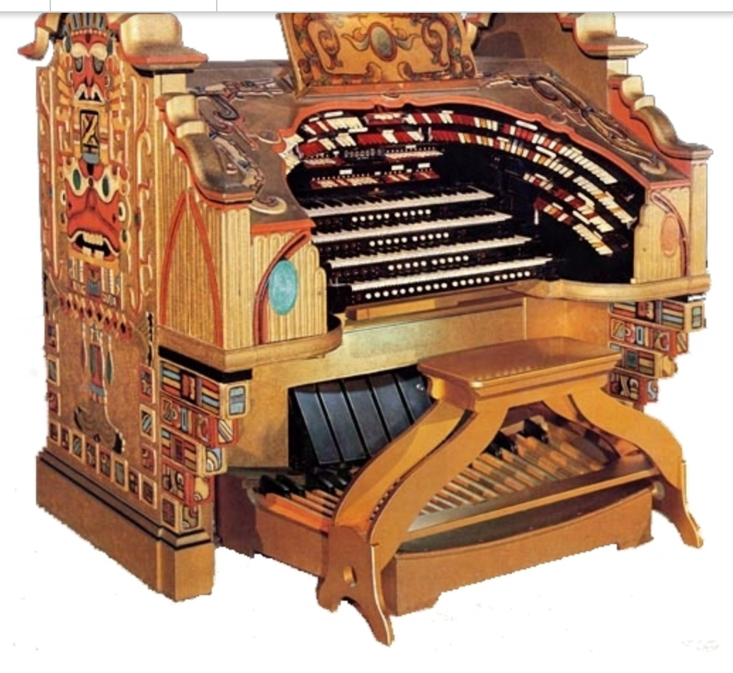
Hear the Mighty Wurlitzer Organ!