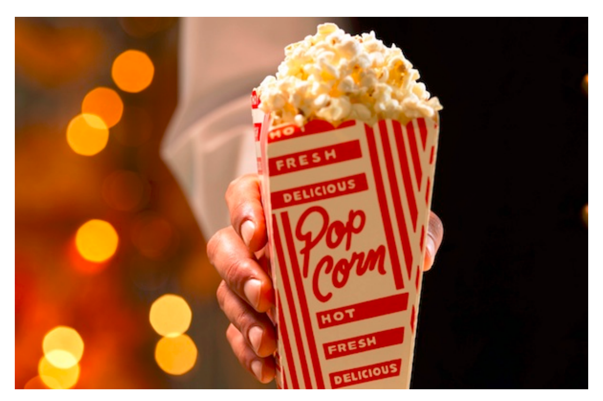
We have freshly popped Popcorn with REAL butter at our snack bar!