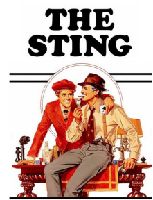
The Sting Saturday, June 24 8:00 p.m.