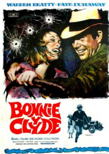
Bonnie & Clyde Friday, May 12 8:00 p.m.