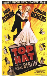
Top Hat Saturday, April 15 8:00 p.m.

Doors open one hour prior to movie. Organ overture thirty minutes prior to movie. Visit us on the web at www.dtos.org .