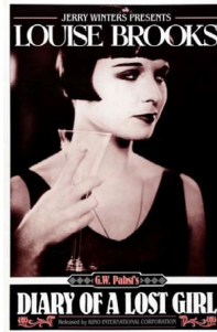
Diary of a Lost Girl Saturday, May 27 8:00 p.m.