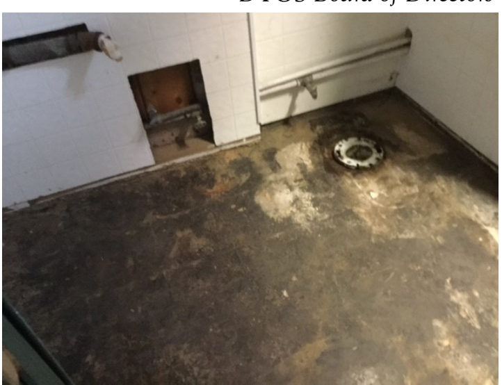
Artist's bathroom floor getting much-needed work done.

Cost to date has been under $75 as we are doing most work ourselves and a plumber friend has volunteered his time.