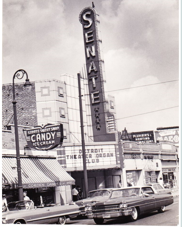
The front of the Senate Theater in a not-so-distant past