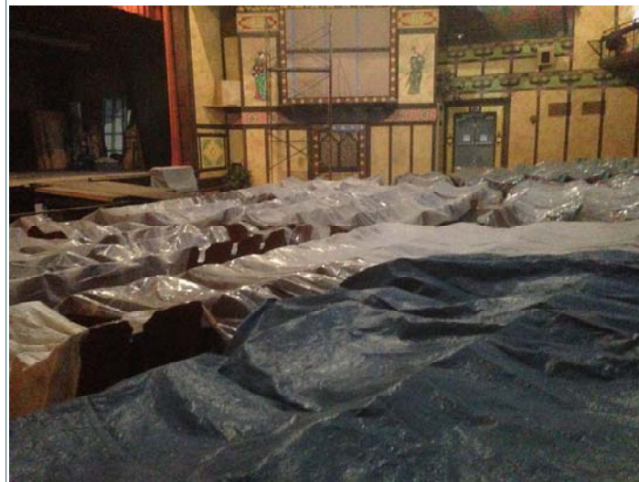
The main floor is all covered to minimize the clean-up effort when the restoration is finished.