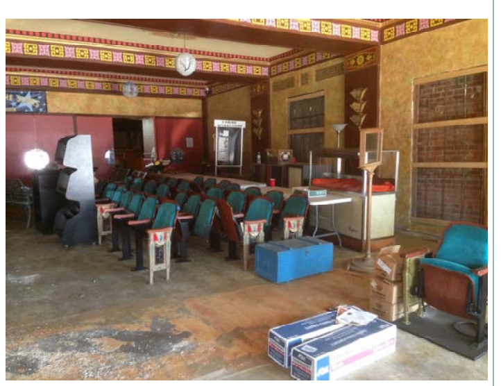
The outer lobby is being used as a temporary storage room while waiting for the restoration to progress.