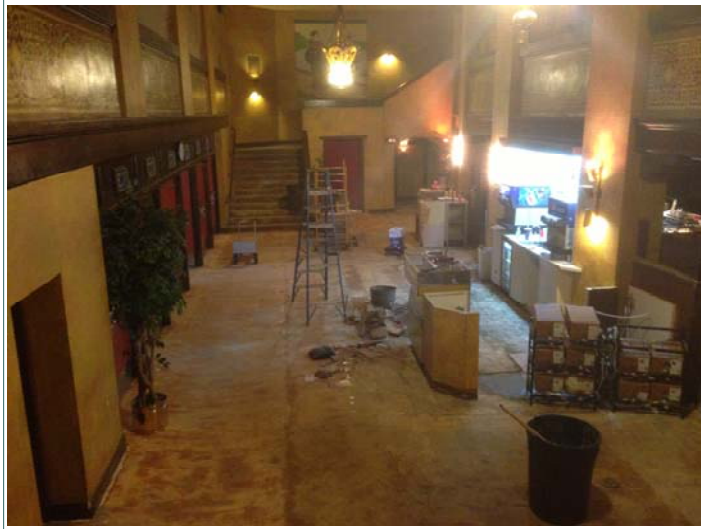
The inner lobby, showing the concession stand torn apart and the carpet removed.

Be sure to visit the Redford after they open to see the marvelous job the Motor City Theatre Organ Society is doing to keep their prized theatre going strong!