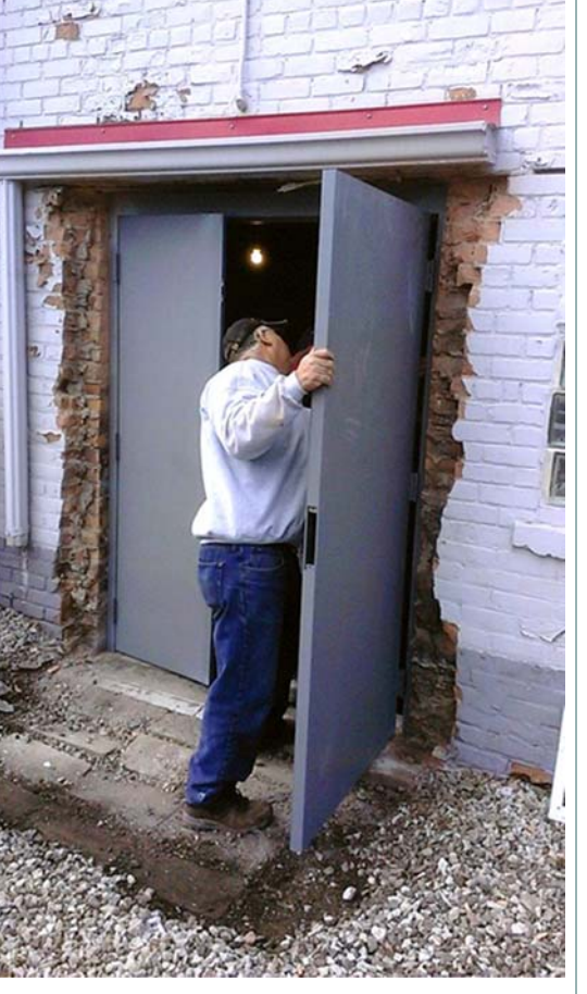
The New Door Goes In

This door is located on the right side of the auditorium and can be found behind the curtains. It is at the top of a set of stairs.