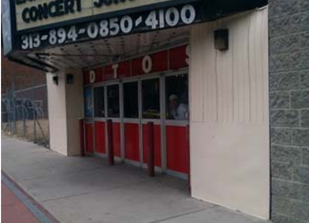
This is the finished work on the main entrance.