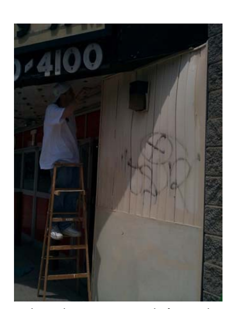
This is the main entrance before work was completed.

We will be replacing one of the necessary side exit doors. This is going to cost us about $2,100. As you know we depend on donations from our membership and others. Any amount that anyone may contribute will certainly help keep our club open. You may donate our web o n site www.dtos.org or drop a check in the mail to DTOS 6424 Michigan Avenue Detroit, MI. 48210. Thank You in advance for anything you can do.