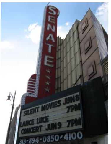
The marquee announces Lance Luce's concerts for the 50th anniversary