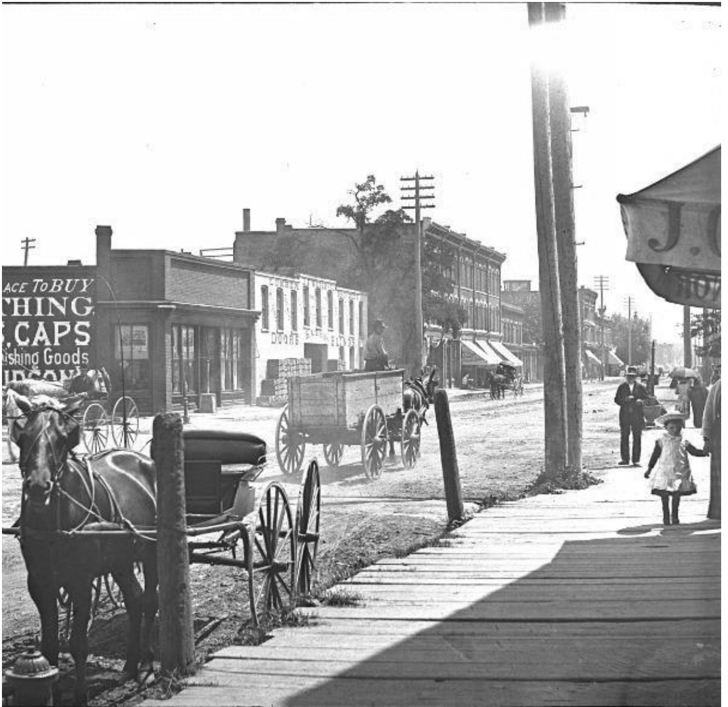
Looking northeast to Trumbull and Michigan Avenue in the 1880s. The three-story building near the center still stands at 1416-32 Michigan Ave.