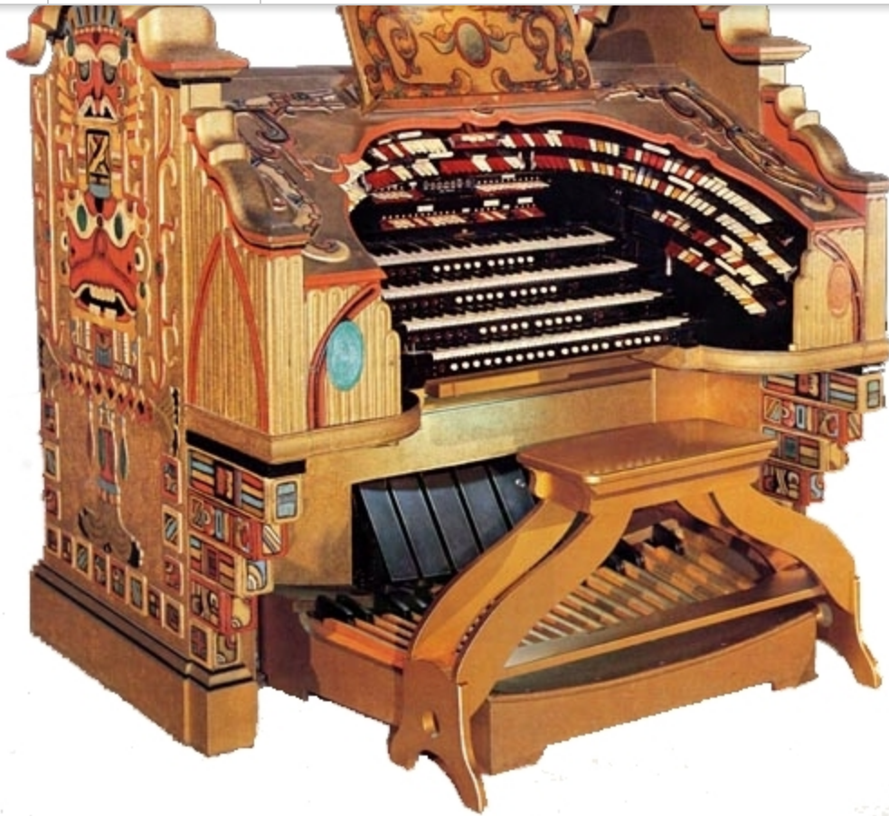
Hear the Mighty Wurlitzer Organ!