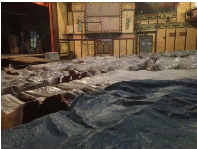
The main floor is all covered to minimize the clean-up effort when the restoration is finished.