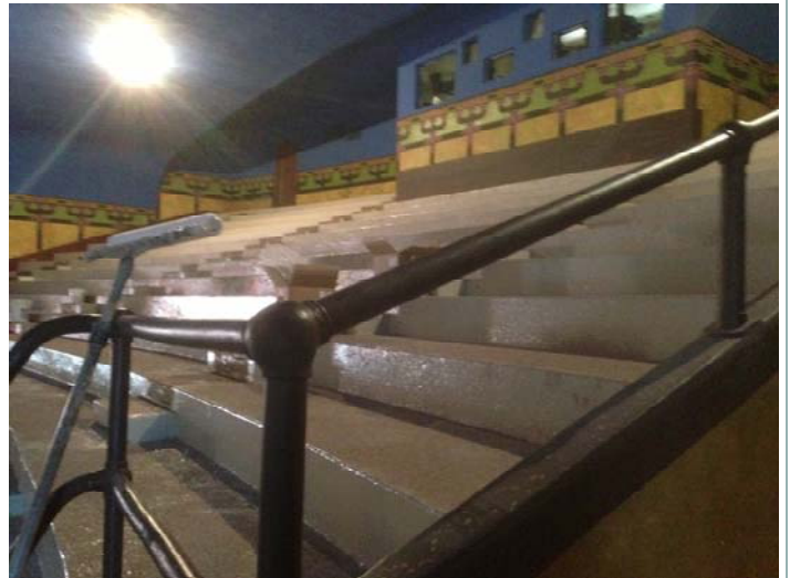
The upper balcony with all seats removed and the floor refinished.