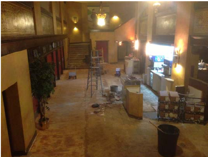
The inner lobby, showing the concession stand torn apart and the carpet removed.

Be sure to visit the Redford after they open to see the marvelous job the Motor City Theatre Organ Society is doing to keep their prized theatre going strong!