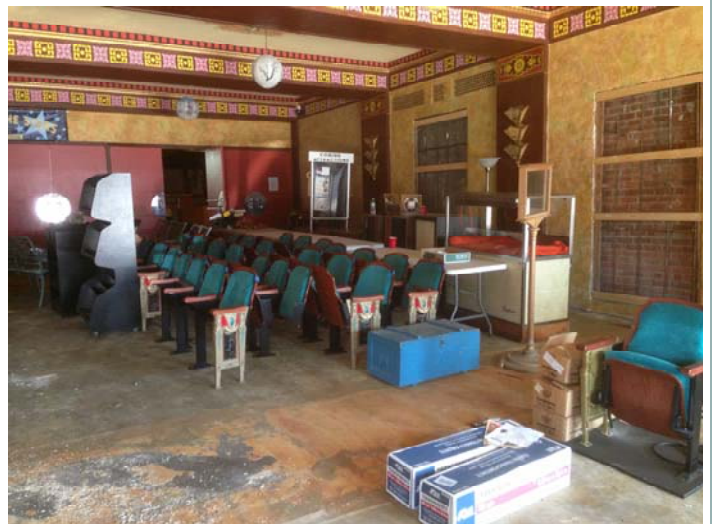
The outer lobby is being used as a temporary storage room while waiting for the restoration to progress.